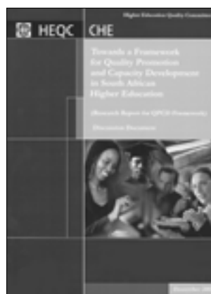
CHE Towards a Framework for Quality Promotion and Capacity Development in South African Higher Education