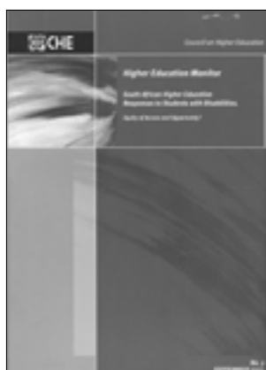
CHE South African Higher Education Responses to Students with disabilities