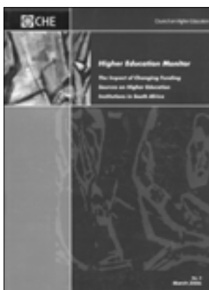
CHE The Impact of Changing Funding Sources on Higher Education Institutions in South Africa