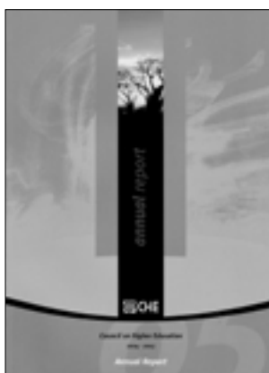
CHE Annual Report 2004 - 2005